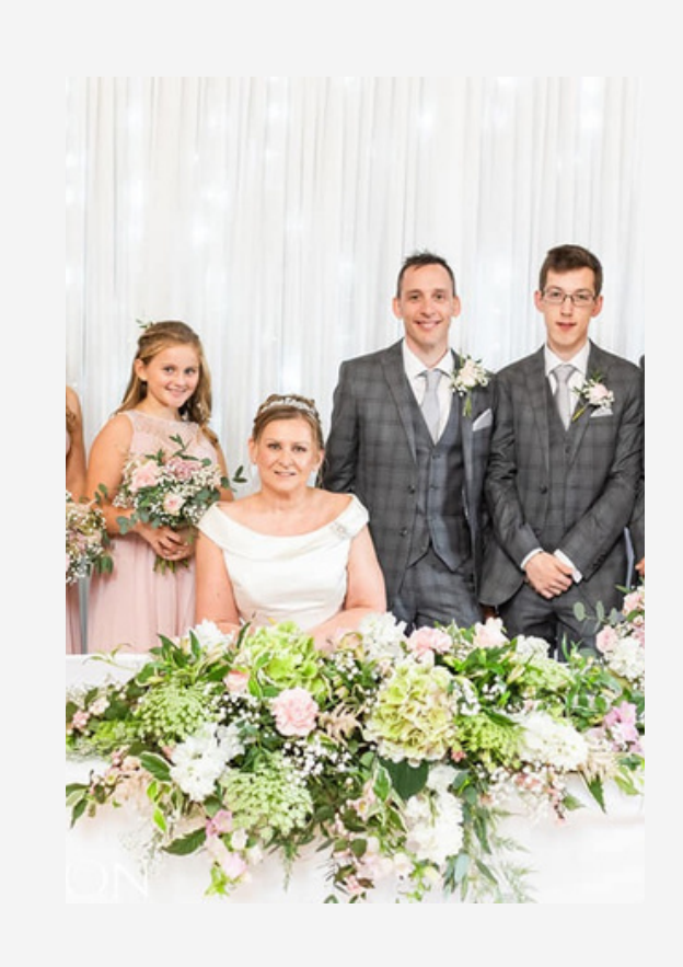
Table centres arranged in a glass vase. Created using coordinating flowers and foliage to those in your bouquet. This price includes the glass vase which is yours to keep. £45